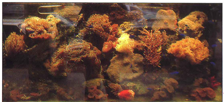
75 gallon reef aquarium with dozens of healthy corals. This tank is located by a large window and natural light is used to display the tank inhabitants. BI OX® is used in an under the tank trickle filter.

Virtually every new aquarium product from the US, Europe and Asia are tested and evaluated in Hong Kong. Only items that prove their value are accepted.