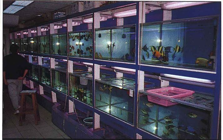
Wall of marine aquariums in one of the larger stores shows some of the variety of marine fish available to Hong Kong hobbyists.

Aquariums in retail stores are heavily stocked with a variety of marine life. Most fish and invertebrates are sold soon after their arrival. Many hobbyists quarantine their new pets prior to introducing them into their display aquariums.