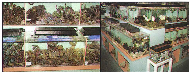
Some of the 37 large display aquariums with over 4000 US gallons that are controlled by 11 separate filter systems. There are 11 quarantine tanks with over 750 US gallons.