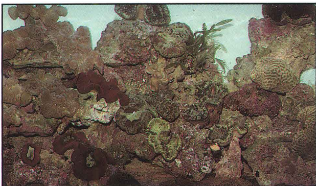
Some of the hundreds of corals and invertebrates for sale.

and Naso tangs along with Longnose butterflies from Hawaii, dozens of clownfish, damsels, blennies, butterflyfish and more from the Indo Pacific are all thriving in the Las Vegas Desert at Rainbow Seascapes.