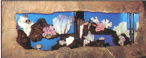
Rainbow Seascapes designs, installs and maintains dozens of fantastic super show sized marine aquariums in the major hotels in Las Vegas.

RAINBOW SEASCAPES is 2000 sq. ft. with 11 systems. An unbelievable display of healthy, tank acclimated Asfur angels and Semi-larvatus butterflyfish from the Red Sea, Queen triggers and Royal Grammas from the Caribbean, Powder Blue tangs and Annularis angels from the Indian Ocean, Achilles