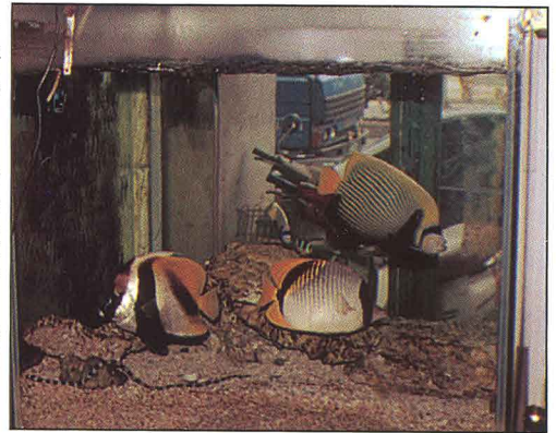
Photo at right. Most stores have a display marine tank in their window.

This is a 150 US gallon saltwater system with adult Emperor angel and butterfly fish. Window tanks are from 125 to 350 US gallons.