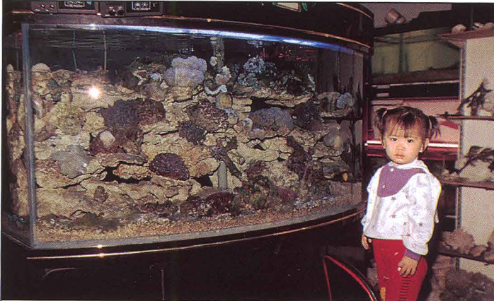
Future marine fish and reef keeper is fascinated with the myriad of captive ocean life in this 150 US gallon custom display aquarium.