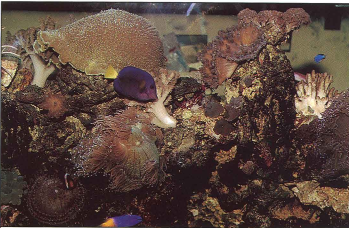
Corals and marine fish thrive in this 60 US gallon marine reef.

The most successful approaches to keeping marine fish and reef aquariums has been the unique blend of Euro-American styles of keeping saltwater aquariums. The European approach features the extended use of high quality support equipment. The American approach is to display as many colorful captive marine pets as possible. In Taiwan, trickle filters, protein skimmers, halide lighting, temperature controllers, chillers, pressurized filter systems, regular water changes are part of successful marine fish and reef keeping.