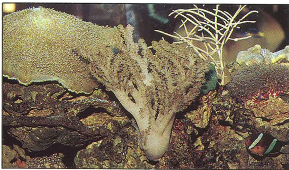
Photo left. Hard and soft corals thrive in a 40 gal. tank.

This is a 150 US gallon saltwater system with adult Emperor angel and butterfly fish. Window tanks are from 125 to 350 US gallons.