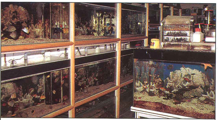
Marine fish and reef aquariums in one of Taiwan's best stores.

Clownfish Amp. sebae enjoys life in a healthy reef tank.