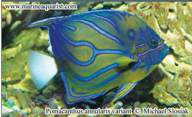
Pomacanthus annularis variant

Pomacanthus annularis requires plenty of swimming room and hiding places in the aquarium. They have been observed nipping at sessile invertebrates, such as corals, clams and nudibranches. Thus, the Pomacanthus annularis is not a good choice for inclusion in a reef type (live coral) aquarium. ♦