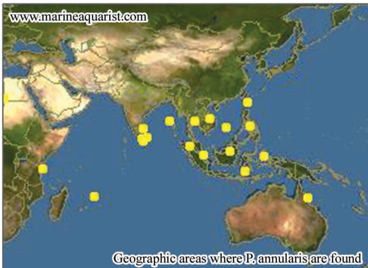
Geographic areas where P. annularis are found

The common name of the “Blue Ring Angelfish” was given due to its blue circle or ring found behind the eye and above the pectoral fin (Del Prete 1974).