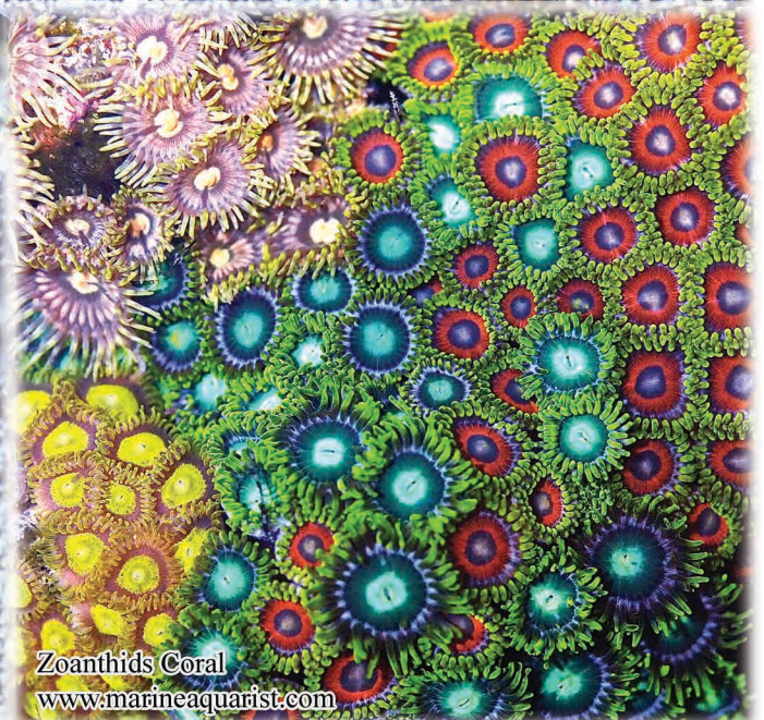
Zoanthids Coral www.marineaquarist.com